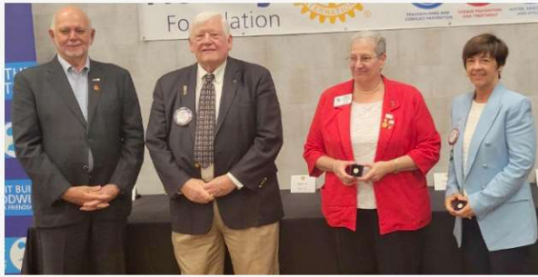
Paul Harris Fellow + 8